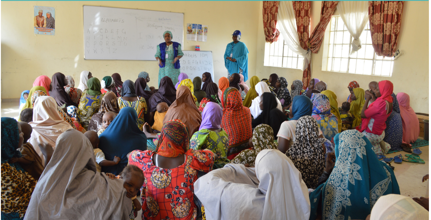
Boko Haram victims at a rehabilitation center in Maiduguri, Nigeria.