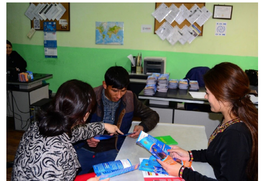
Information campaigns on the harmful effects of drug and substance use among migrant youth in Lebap region, October, 2016.

Given the protracted nature of the crisis in Syria, national and international assistance agencies face immense challenges in providing for the needs of refugees and host Lebanese communities due to the high burden of NCDs among both populations. To improve the quality of care and health outcomes for patients with hypertension and type II diabetes, a study was implemented over 20 months to evaluate the effectiveness of mHealth, an electronic application. mHealth is a software application that serves as an electronic, patient controlled, medical record, including information on prescriptions and healthy lifestyle behaviors. Supported by IOM and the International Medical Corps, mHealth was tested in 10 health clinics in Southern Lebanon, Bekaa, Beirut, and Mount Lebanon that serve Syrian refugees and host communities. The mHealth tool has the potential to improve quality and continuity of care, health literacy, mobility of medical records, and health outcomes for patients.