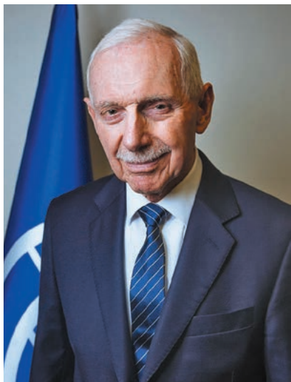
IOM Director General William Lacy Swing

At the end of 2015, the Government of Canada requested the International Organization for Migration (IOM) to support the Prime Minister's commitment to admit 25,000 Syrian refugees from the Middle East spanning a three-month operation from December 2015 through February 2016.