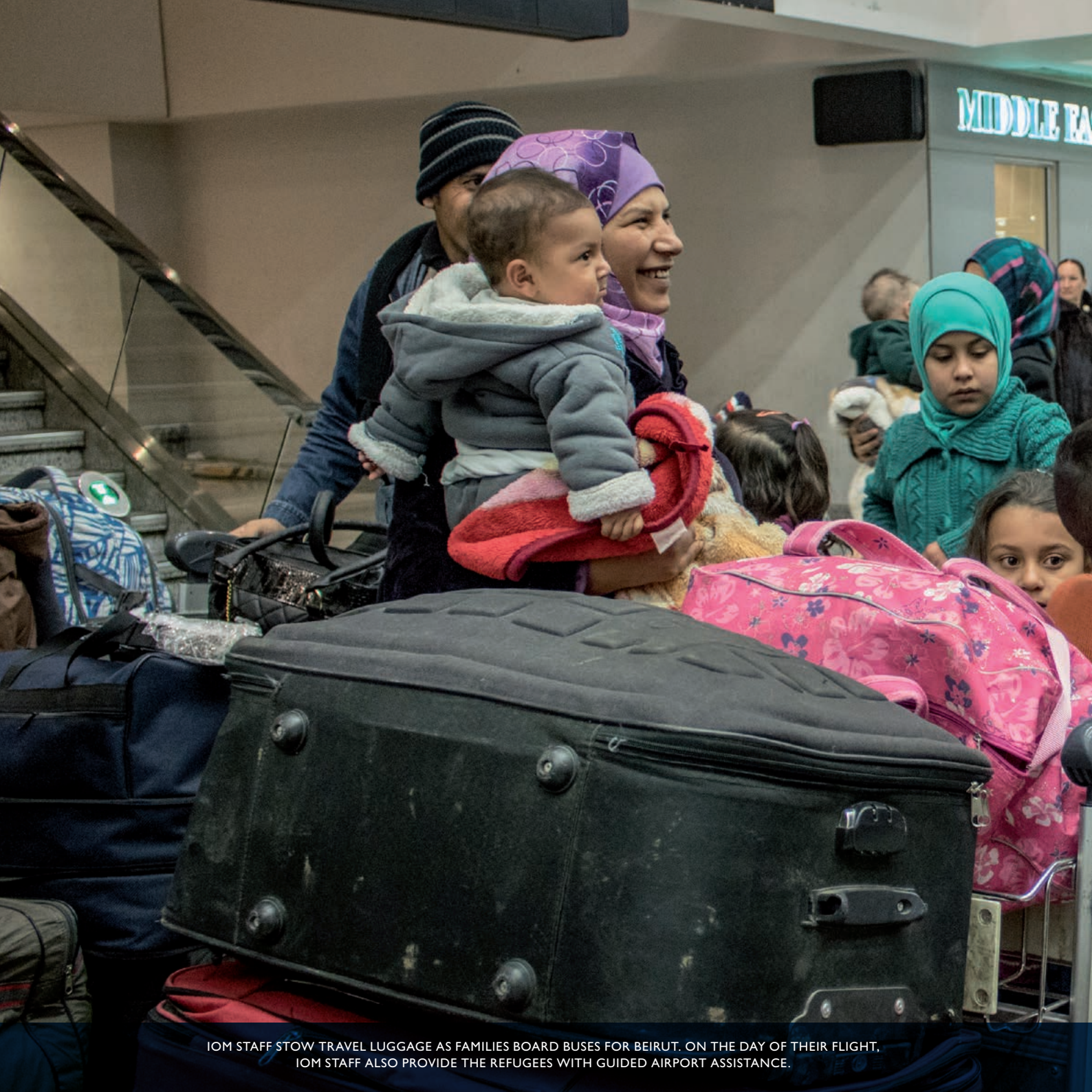
IOM STAFF STOW TRAVEL LUGGAGE AS FAMILIES BOARD BUSES FOR BEIRUT. ON THE DAY OF THEIR FLIGHT, IOM STAFF ALSO PROVIDE THE REFUGEES WITH GUIDED AIRPORT ASSISTANCE.