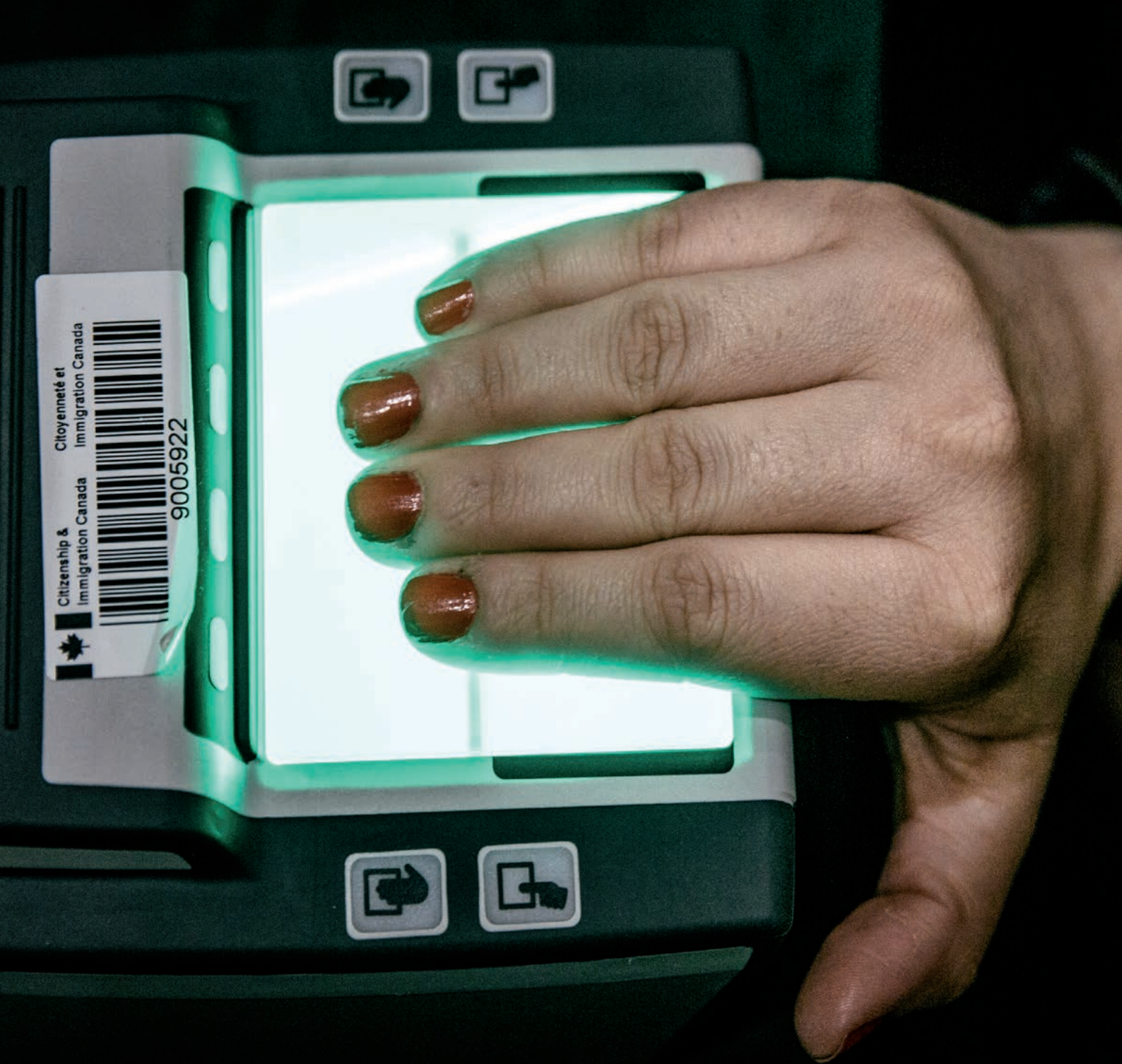
A WOMAN HAS HER FINGERPRINTS TAKEN AS PART OF BIOMETRIC REGISTRATION AND IDENTIFICATION WITH CANADIAN AUTHORITIES.