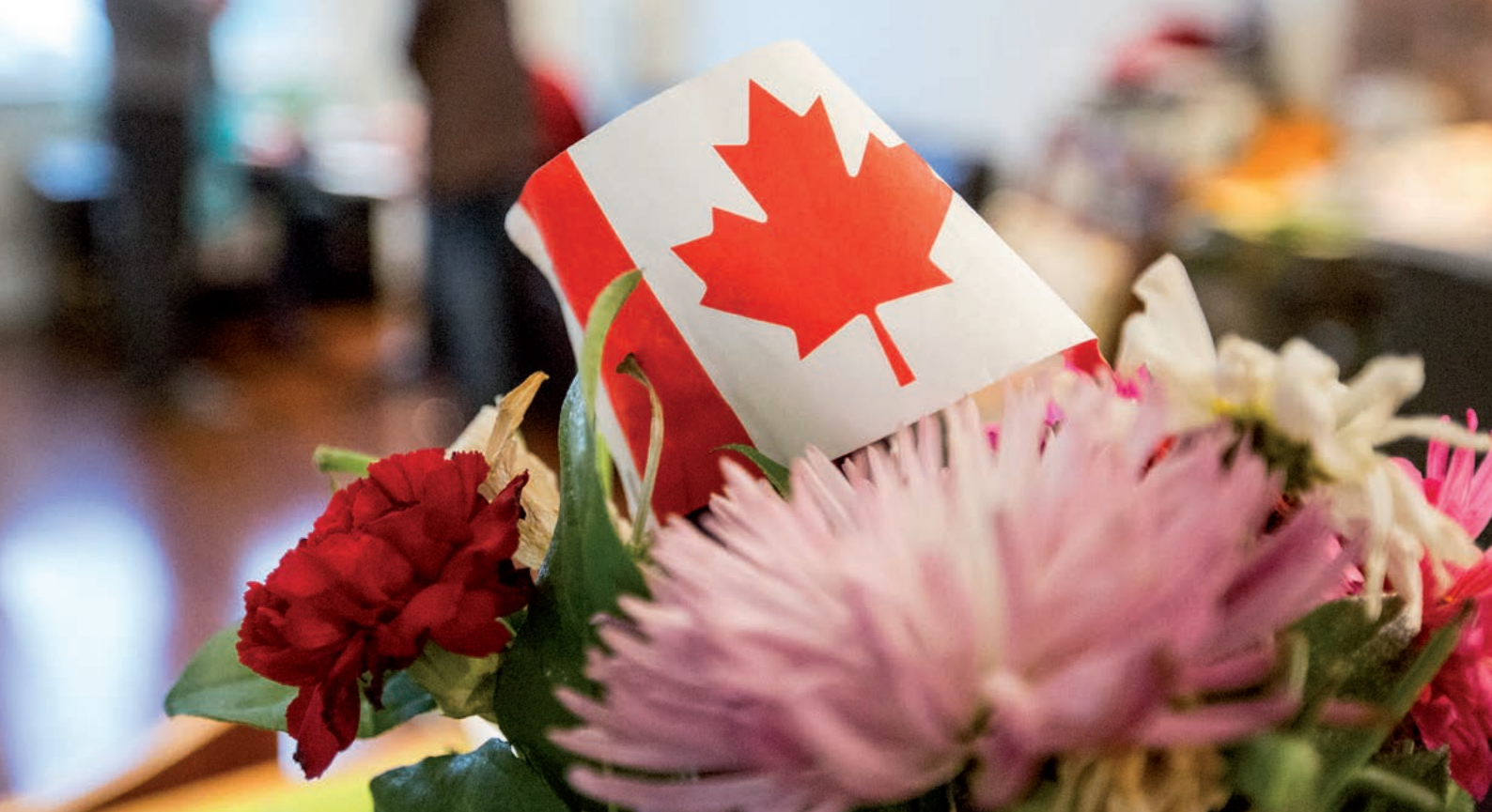
A CANADIAN FLAG ADORNS A BOUQUET GIVEN TO A NEWLY ARRIVED SYRIAN FAMILY.

INTERNATIONAL ORGANIZATION FOR MIGRATION www.iom.int