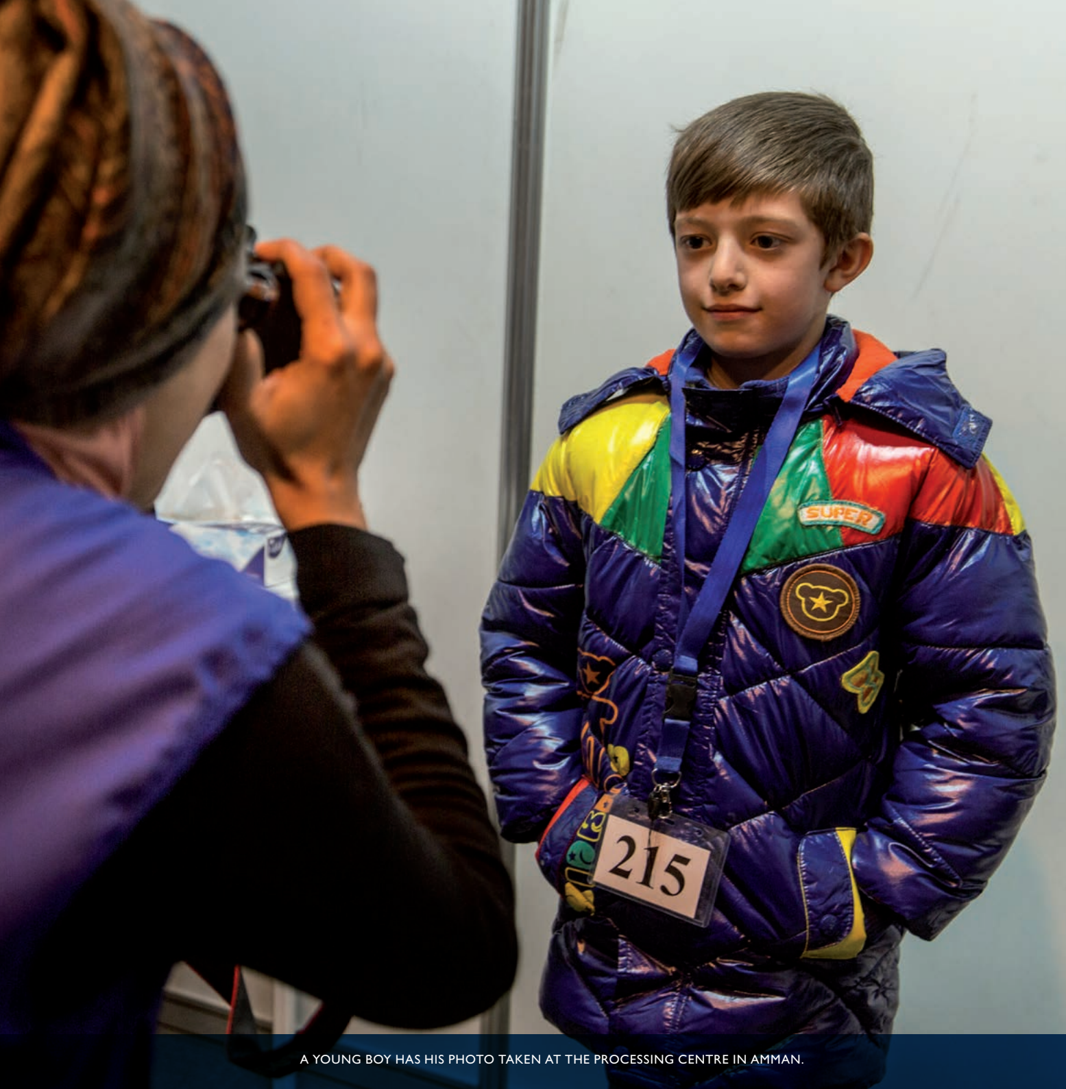
A YOUNG BOY HAS HIS PHOTO TAKEN AT THE PROCESSING CENTRE IN AMMAN.