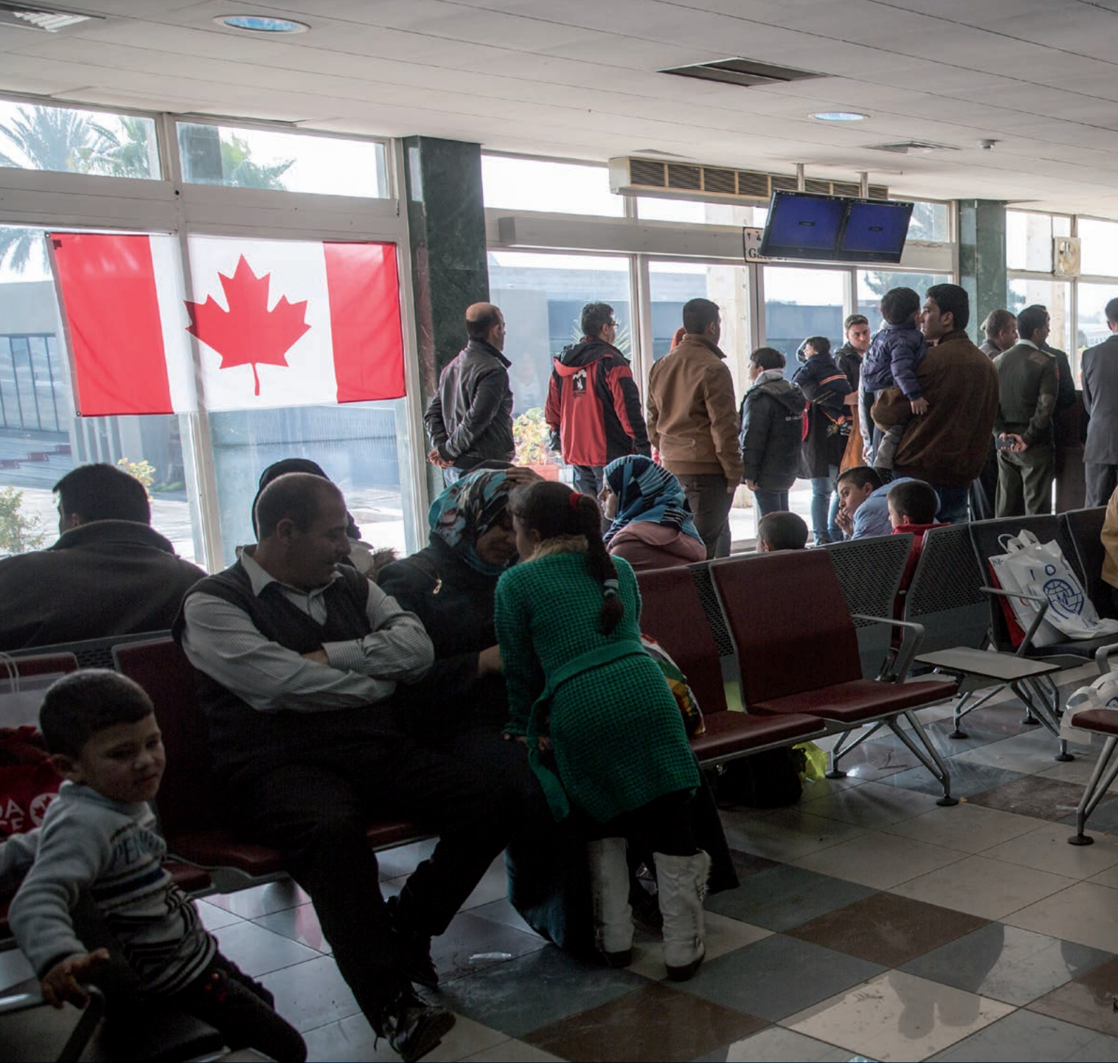
A CANADIAN FLAG ADORNS A WINDOW AT THE FLIGHT GATE WHERE PASSENGERS AWAITED THEIR DEPARTURE.