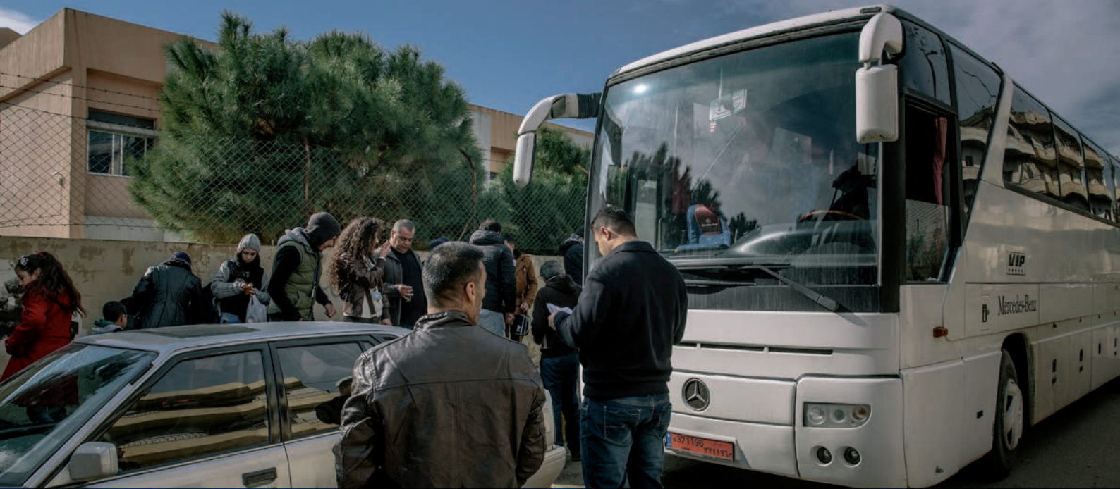
IN ZAHLÉ, IOM STAFF ENSURE THAT ALL PASSENGERS ARE ACCOUNTED FOR AS FAMILIES BOARD BUSES HEADED FOR THE CASE PROCESSING SITE IN BEIRUT.