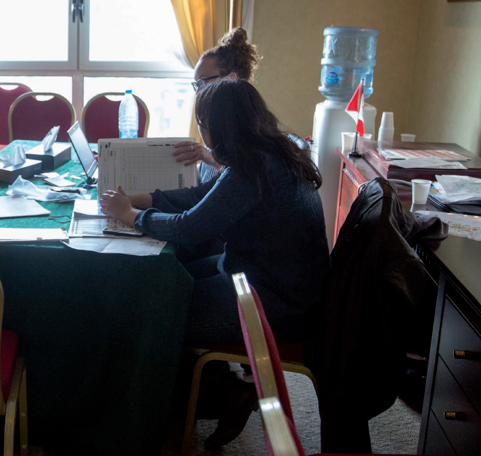
A REFUGEE FAMILY BEING INTERVIEWED BY A CANADIAN OFFICIAL AND AN INTERPRETER IN BEIRUT.