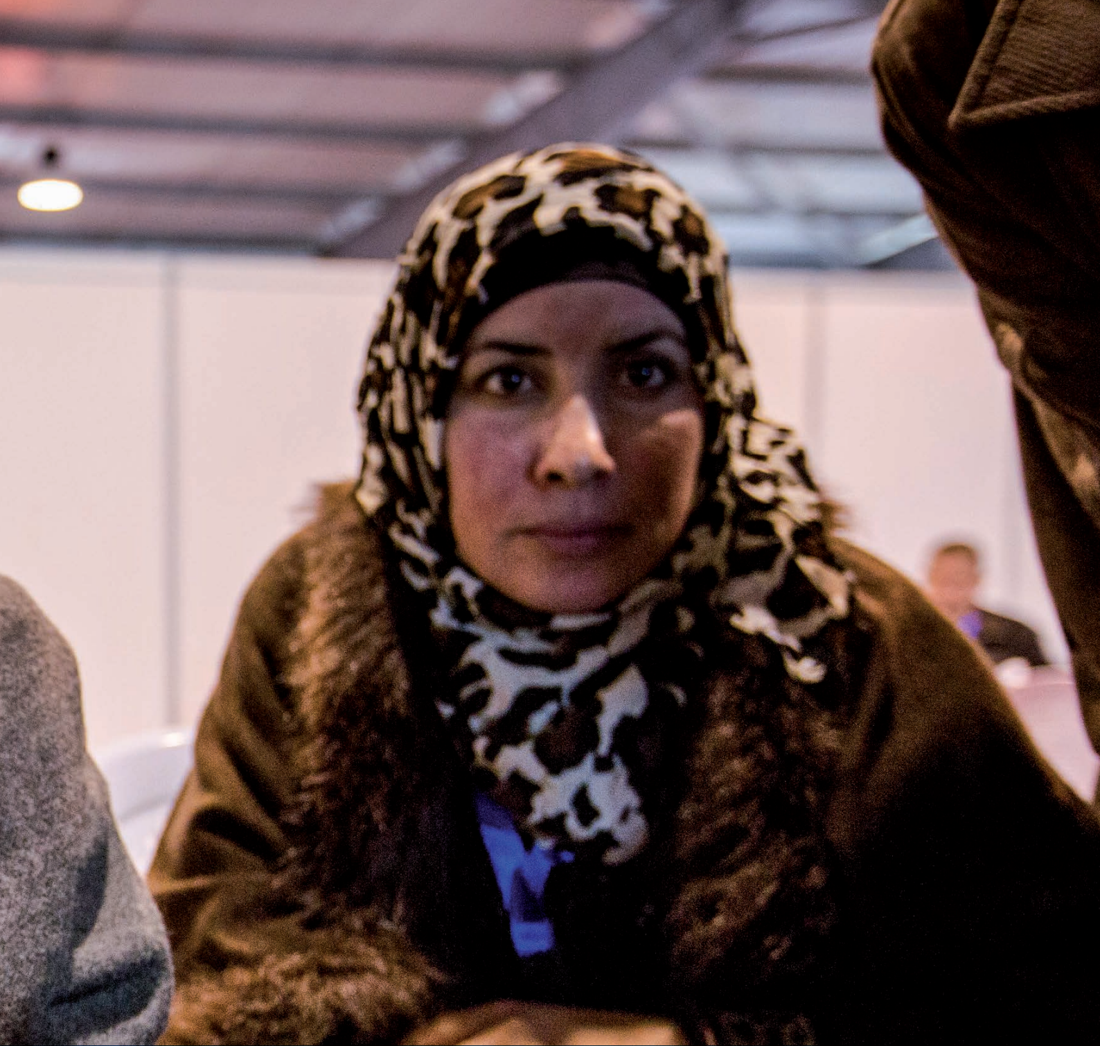
TWO SYRIAN WOMEN WAIT IN ANTICIPATION AT THE PROCESSING CENTRE IN AMMAN.