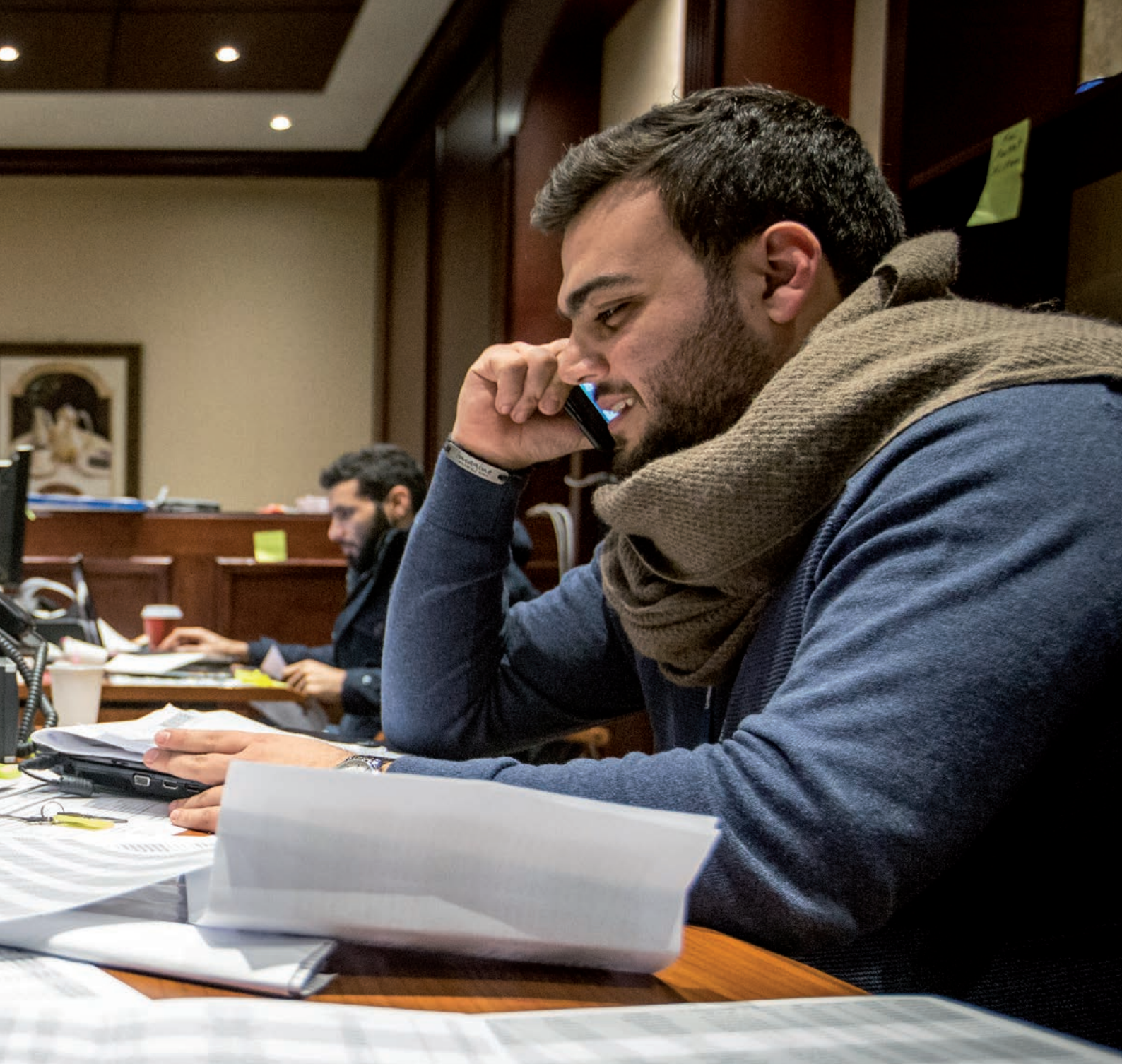
IOM STAFF SPEAK WITH REFUGEES TO SCHEDULE THEIR PROCESSING APPOINTMENTS AT THE CALL CENTRE IN BEIRUT.