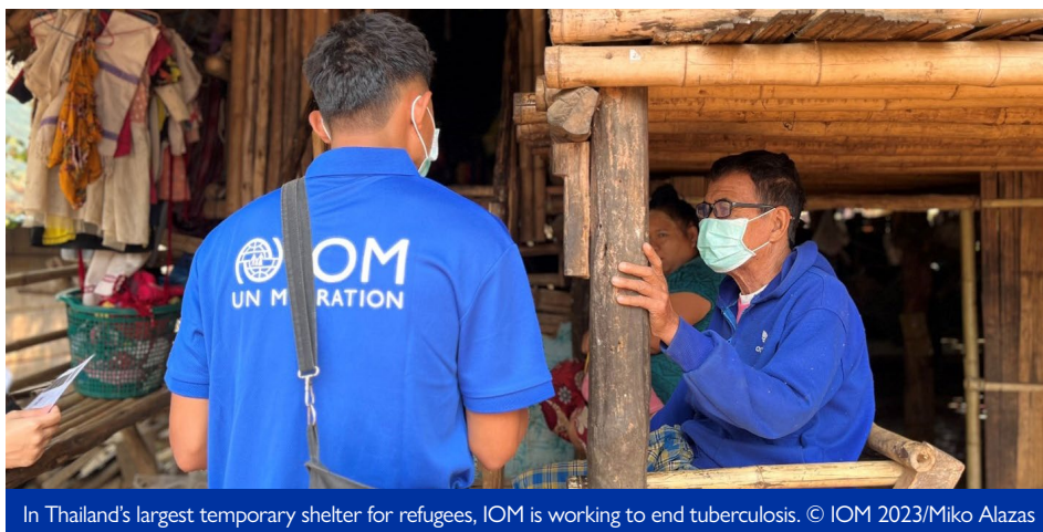
In Thailand's largest temporary shelter for refugees, IOM is working to end tuberculosis.

Since the early 2000s, IOM has received funding of over USD 200 million and served as both a Principal Recipient and Sub-Recipient for Global Fund grants across diverse settings and contexts, implementing multi-country and single-country projects in Africa, Asia Pacific, Latin America, and the Middle East. These initiatives aim to address systemic health issues among migrants and offer technical support to governments and partners in promoting migrant-friendly health services.