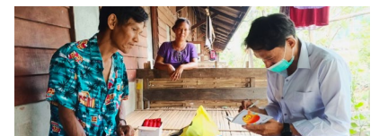
TB therapy in Myanmar.