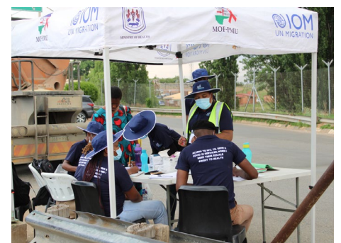
Health screening in Lesotho border community.

The centrepiece of this project is the integration of migration and population mobility into Lesotho's current national plans for HIV, TB, and COVID-19. It emphasizes aspects of continuity of care for HIV and TB among migrants and migration-affected communities and building the capacity of the Ministry of Health (MoH) and the National AIDS Commission (NAC) to implement and lead migration-sensitive strategies in Lesotho. The project was implemented in collaboration with the MoH; the NAC; the United Nations Programme on HIV/AIDS (UNAIDS); WHO; the United Nations Children's Fund (UNICEF); and other UN agencies.