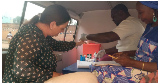
Mobile Medical Unit in N'Zérékoré, December 2022.

A differentiated strategy — operationalizing a Mobile Medical Unit, a Close-Quartered Dispensary and the dispensing of HIV self-testing — made it possible to reach hidden key populations (i.e. sex workers and men who have sex with men).