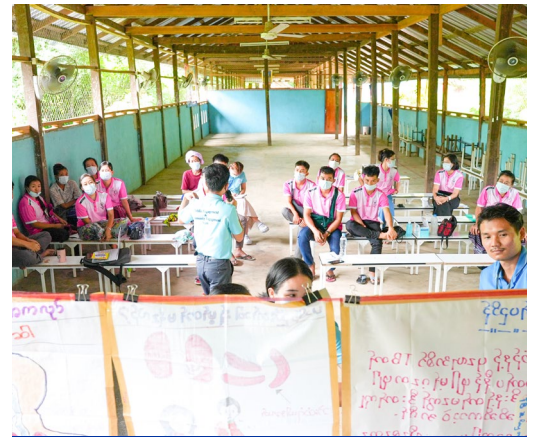
Community engagement and health awareness session at a school in Thailand.

The programme's key feature is its inclusivity, covering populations not included in existing national TB Programmes or grants. It targets those highly vulnerable to TB due to prevalence, co-infection, social determinants of health, or barriers to accessing diagnosis and treatment. These groups vary by context/location and include cross-border migrants, returnees, refugees, host communities, migrants in special economic zones, IDPs, LGBTQI+ migrants, as well as other vulnerable populations like victims of trafficking, the elderly, and individuals living with HIV/AIDS.