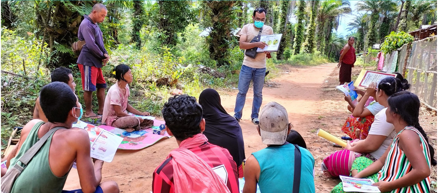
IOM field staff conduct a tuberculosis awareness activity in Hlaing Shwe Li Village Kawthaung Township, Myanmar; October 2023.

The Global Fund to Fight AIDS, Tuberculosis and Malaria (Global Fund) and the International Organization for Migration (IOM) partnered in 2015 to collaborate in the fight against these three diseases in the context of migration. Through this collaboration, the two organizations have committed to addressing the unique health challenges faced by mobile populations around the world; to achieving the United Nations' Sustainable Development Goal focused on health and well-being; and to advancing Universal Health Coverage. The alliance between the Global Fund and IOM is driven by a mutual interest in protecting the health of migrants, internally displaced persons, and other people on the move.