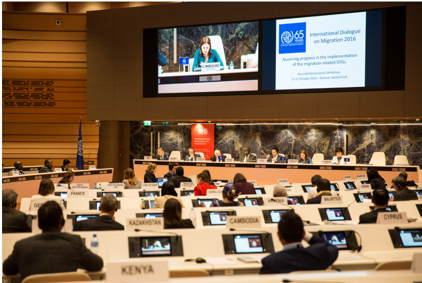
Panel discussion at IDM in Geneva.